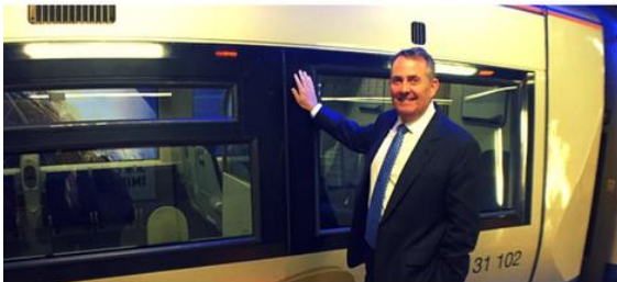
Johannesburg: with UK-manufactured Gautrain carriage