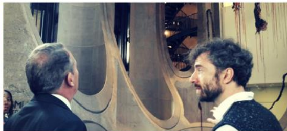
Cape Town: visiting Zeitz MOCAA with Thomas Heatherwick