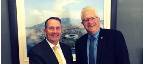
Cape Town: with Min. of Economic Opportunities Alan Winde