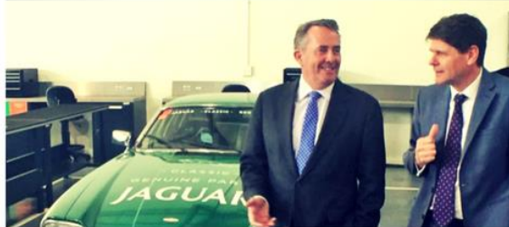
Johannesburg: visiting JLR Training Academy