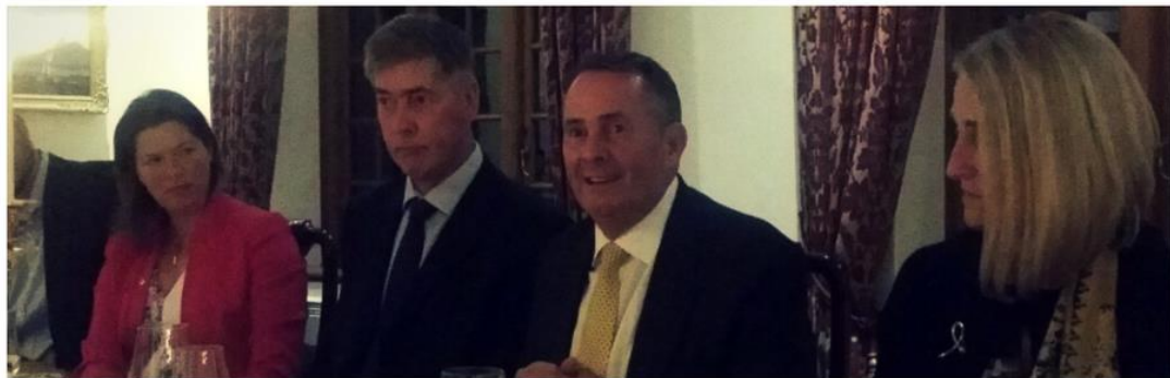
Cape Town: dinner engagement with Chamber members